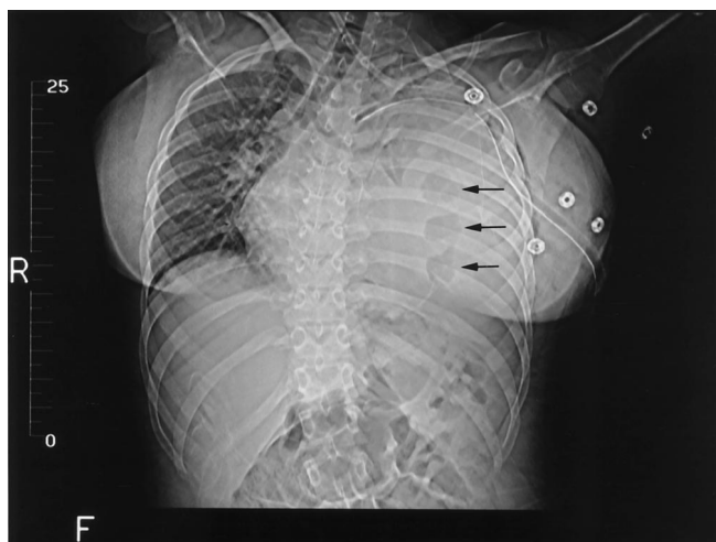
Fig. 1. Supine computed tomography scout film of the chest showing almost complete left lung collapse, mediastinal shift, and tracheal deviation. A chest tube is in place. Note the presence of air within the segmental loops of bowel (arrows).