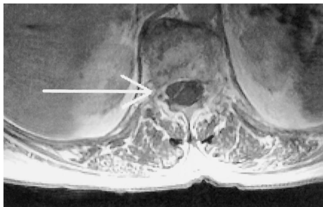
Fig. 2. Axial magnetic resonance image showing the hematoma.

logic examination revealed decreased muscular strength in both lower limbs and decreased sensation up to the dermatome L1. A magnetic resonance image revealed a spinal-epidural hematoma extending from T10 to L4, with an intradural extension in the caudal section (figs. 1 and 2). Emergency decompressive surgery was performed 6 h after the first neurologic symptoms had been noticed. The intraoperative site showed a partially organized as well as a fresh hematoma. There was no evidence of neoplastic changes or vascular malformations. Postoperatively, the patient recovered slowly from her neurologic deficiencies. Control magnetic resonance imaging 5 days later showed a small, infarcted area within the spinal cord at the level of T10. In a detailed interview, during which the patient was asked about specific drugs taken preoperatively, she mentioned that she had taken 500 mg ibuprofen four times daily on her own for her arthritic pain and that she had taken the last dose approximately 10 h before surgery. Four weeks after the event, muscular strength and sensation of the right leg had recovered. A discrete muscular weakness of the left leg with an area of hypesthesia at the foot persisted for 1 yr.