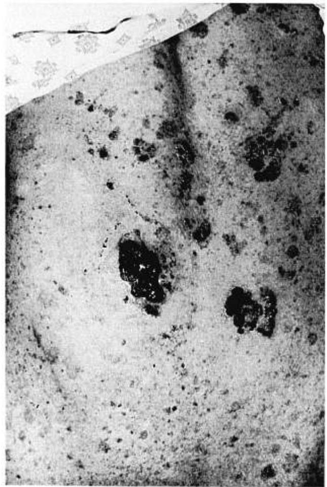
FIG. 1. Posterior chest wall, showing hyperpigmentation, multiple keratoses, and ulcerating squamous-cell carcinoma, secondary to chronic arsenism.

In 1964, a cutaneous lesion developed at the base of the neck. It was excised and diagnosed as a granuloma secondary to chronic arsenism. In 1970, the patient was admitted to another hospital with a four-week history of dyspnea and increasing stridor following an upper respiratory infection. Bronchoscopy revealed a mass below the vocal cords, about 4 cm above the carina. Biopsy demonstrated a